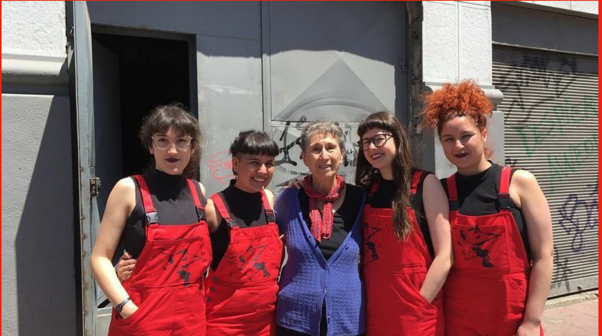
Colectivo Lastesis With Silvia Federici